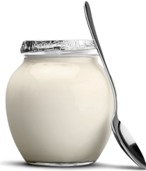
Reduced fat yoghurt tub

Looking for some sweet everyday snack ideas that require little preparation? See below for some easy options.