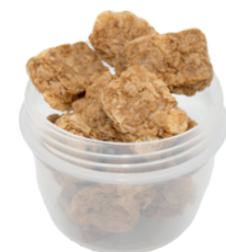
Wholegrain cereal bites