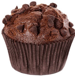
Chocolate chip muffin