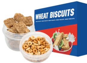
Wholegrain cereal bites